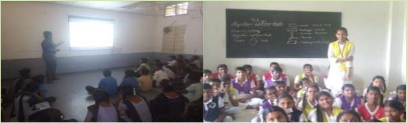
EEE students Creating awareness among school children on importance of science and technology