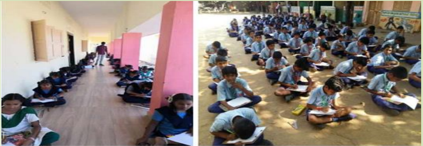
Conducting Essay competitions for school children